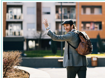
See you later.